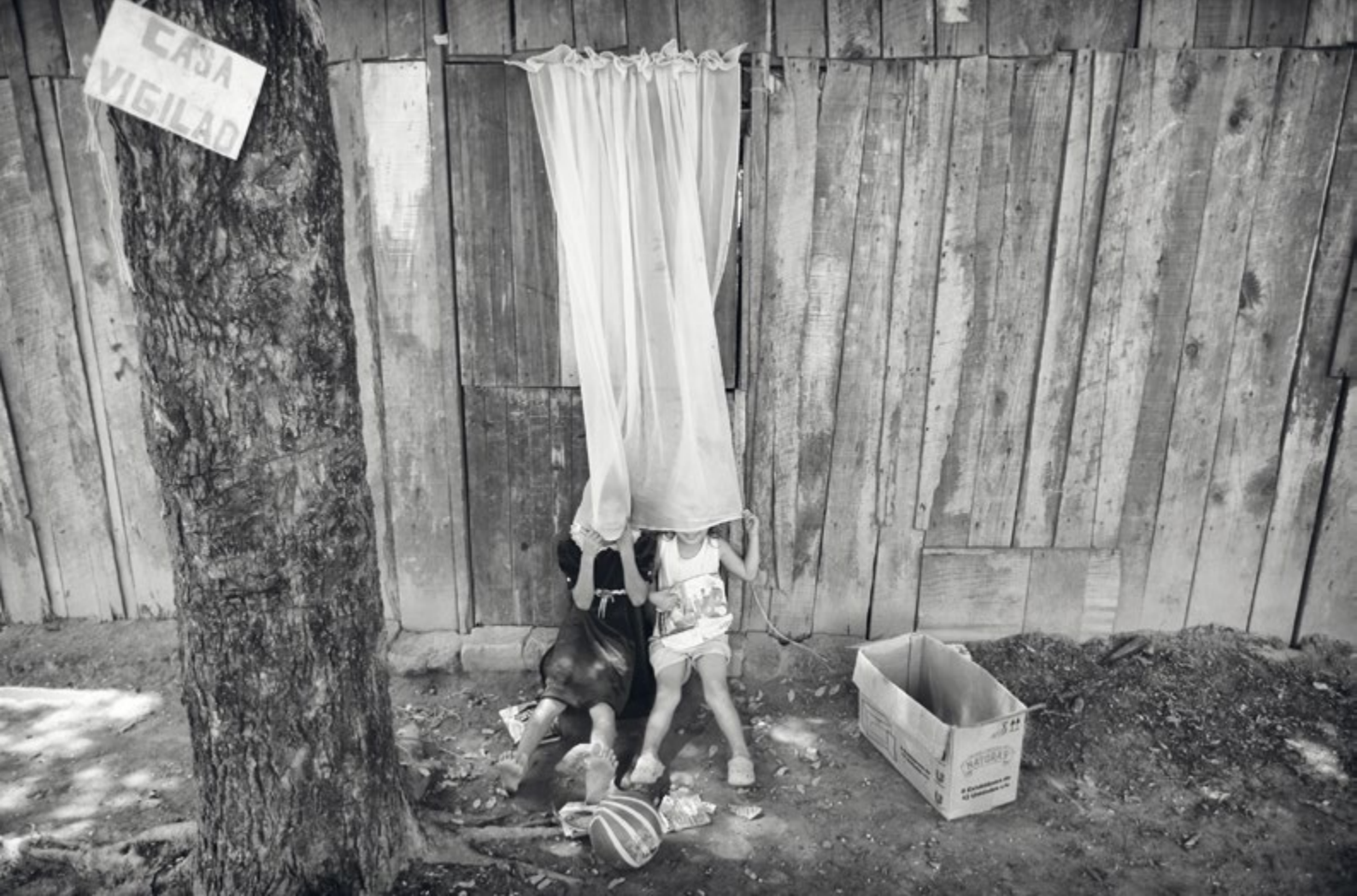
Two girls play in the neighbourhood of Comunidad Bordos Llanos de Sula, San Pedro Sula, just a few blocks away from a murder scene where police found buried bodies.

between the intensity of criminal violence and population movement. As depicted in the graph, displacement levels remained relatively stable between 2004 and 2008, but rose noticeably between 2009 and 2013. 126 This trend coincides to some extent with the rise in homicide rates, an indication of the degree of violence to which people were exposed. 127