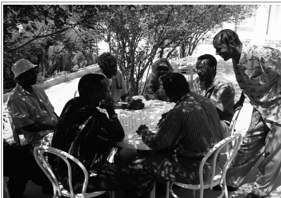
Group work during a training workshop in Hargeisa, Somaliland, in August 2004.

In June, the Project also delivered a briefing on the Guiding Principles and the international response to internal displacement to staff members of Swedish Aid Agency SIDA.