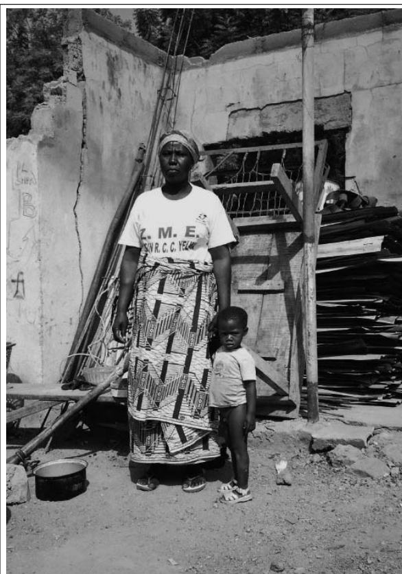
A widow with one of her nine children in Yelwa, Nigeria. The Global IDP Project interviewed IDPs, local authorities and international agencies during a number of fact-finding missions conducted in 2004