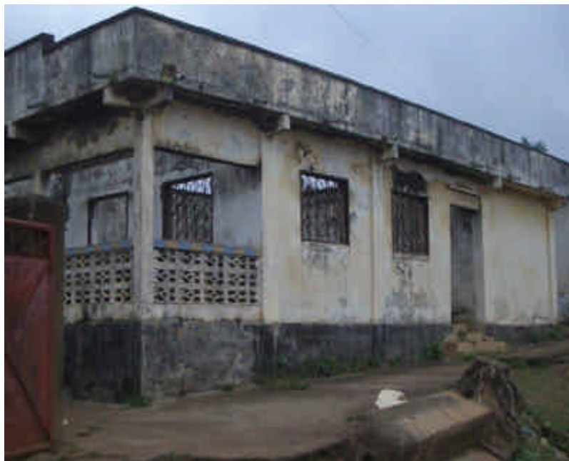
House destroyed during attacks on Guéckédou (Photo: Mpako Foaleng/Global IDP Project, November 2004)

In Guéckédou, at least 25 to 30 per cent of the returned IDPs are in need of food assistance and aid to rebuild their houses and sanitary facilities. The prefectures' services also need institutional support to carry out an assessment of IDP needs for complete rehabilitation (Prefecture Guéckédou, 25 November 2004). Although IDPs who have received assistance from the FAO/OCPH programmes to resume agriculture may start coping and slowly integrating into local communities, many others will continue to be dependent on host communities for survival.