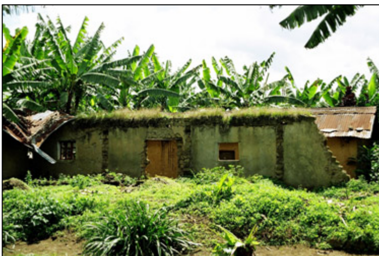
House destroyed during the insurgency of 1997-1998