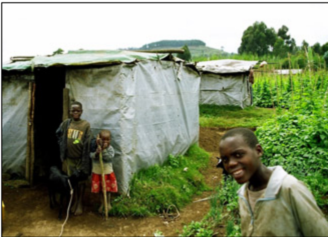
Settlement site along a road in Gisenyi (Birkenes, Global IDP Project)

Housing and living conditions for the relocated people are considerably worse than before the displacement. The conditions in the villages and settlements are appalling, more than four years after the UN stated that “governmental and international efforts to stabilize the situation through durable solutions have advanced beyond the threshold of what still could be called internal displacement”. As of May 2005, there were thousands of makeshift shelters along rural roads in Ruhengeri and Gisenyi. Many have walls of leaves and soil and roofs of plastic sheeting giving very limited protection against rain and temperatures which can drop to 10C (50F) in Ruhengeri. A majority of the households are headed by women and there is a serious shortage of man-power. The hard volcanic soil makes it next to impossible for each household to have proper pit-latrines and access to water and sanitation facilities are reported to be a serious problem in most settlements. One widow in Ruhengeri could only afford to send one of her five children to school, despite the government's Universal Primary Education scheme. She claimed to have been better off in the house she was forced to abandon in 1998 compared to her current situation. She had only been given a plot of 20 by 25 meters of arable land which was supposed to provide sufficient livelihood for her and her children.