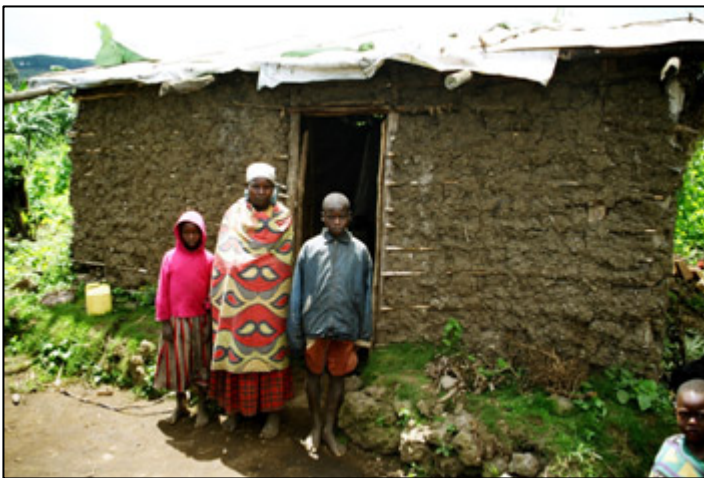
Widow with her children in Gisenyi

The policy applied to all Rwandans, but has affected the different districts differently, depending on the eagerness with which it was implemented by the local authorities, the number and composition of returnees, resistance from the local population and, not least, access to international funding. A study from 2000 – soon after international donors started withholding funding – , revealed that more than 90 per cent of the population in Kibungo and Umutara prefectures lived in grouped villages, whereas Ruhengeri came third with more than 50 per cent, and Gisenyi fourth with 13 per cent. Only a very limited number of people live in villages established under the programme in the other prefectures (ISS, June 2005, p. 326). The high rates in Kibungo and Umutara reflect the high number there of largely Tutsi pastoralists who had fled to Uganda following pogroms in the 1960s and early 1970s and their descendants.