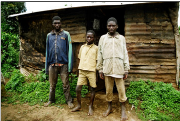
Child-headed household in Gisenyi

The situation changed drastically when the RPA dismantled the refugee camps in what was then Zaire and the Hutu refugees returned between October and December 1996. Many of the returning Hutus found their houses and land occupied by Tutsis and families from the two groups were sometimes forced to share lots (HRW, May 2001). With some reservations, the villagisation policy was largely welcomed by most of the recently returned Tutsi who either did not have any house or property or were illegally occupying other people's houses and plots. Villages predominantly occupied by old case-load have proven to be sustainable more than six years after completion (Global IDP Project visit to Umutara, 15 May 2005).