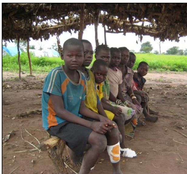
Displaced children in the Kabo IDP site sit in the only temporary classroom still standing after heavy rains in July 2008.

“Internally displaced persons, whether or not their liberty has been restricted, shall be protected in particular against: (a) rape, mutilation, torture, cruel, inhuman or degrading treatment or punishment, and other outrages upon personal dignity.” [Principle 11(2)(a), Guiding Principles on Internal Displacement]