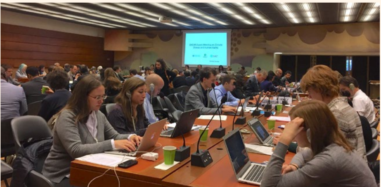
IDMC at OHCHR's Expert Meeting on Climate Change and Human Rights. October 2016

In October, we participated in the first meeting of the advisory committee to the Platform on Disaster Displacement (PDD). The meeting brought together around 80 stake-