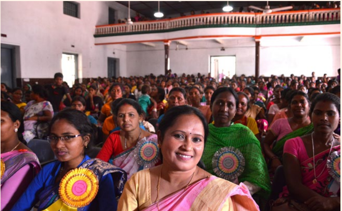
Indigenous community leader defending the rights of Adivasi people from the Ho tribe at risk of displacement by a dam in Jharkhand, India is honoured at International Women's Day celebration in Ranchi. IDMC/Marita Swain, March 2016