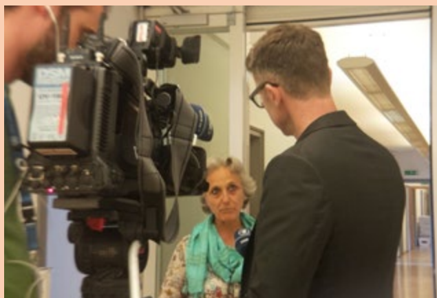
The GRID 2016 was featured in almost 500 news articles. Photo: IDMC/Rachel Natali, May 2016

The relevance of our analysis and research is reflected in numerous references to our work in leading media, including: