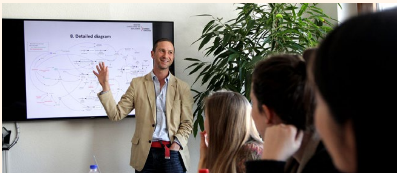
Our Head of Data and Analysis discusses the link between slow onset disasters and internal displacement with Master in International Migration students from the University of Kent.

From our unique position as an independent source of global knowledge, a trusted partner and a convener of technical expertise for decision-makers, we provided evidence, tools and guidance for several global and regional policy processes in 2016.